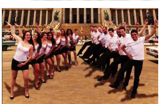
Expresión de Salsa Switzerland